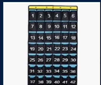
NIMES Numbered Organizer Classroom Pocket Chart for Cell Phones Calculators Holders Blu...